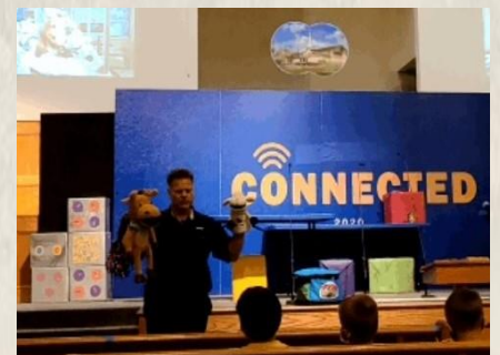
VBS: 1 John 4:4 "...greater is He that is in you..."