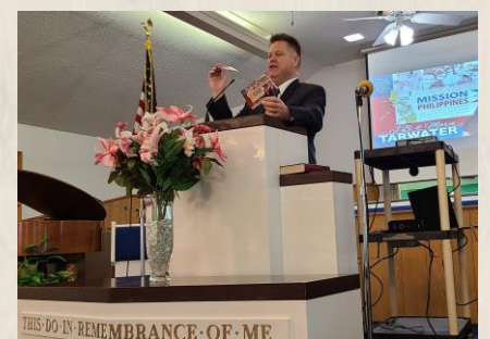
Preaching & Presenting the Ministry