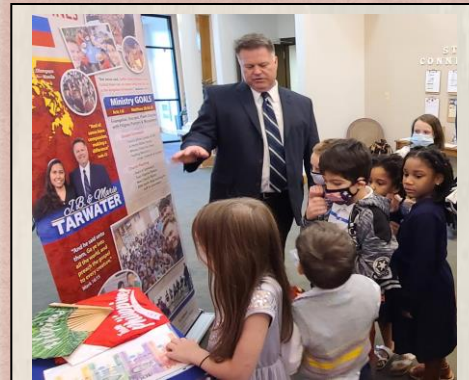
"Let no man despise thy youth, but be thou an example of the believers." 1 Timothy 4:12