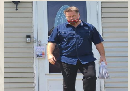
"Gospel Tracts & VBS Flyers Door-to-Door"